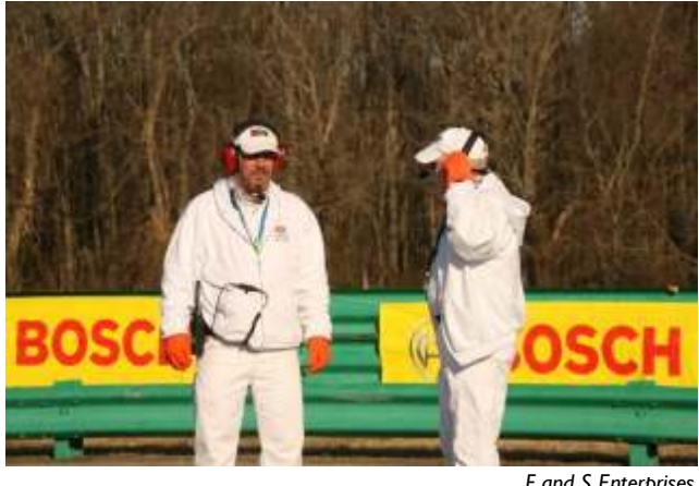
F and S Enterprises

cannot run the ARRC by GRM in the same class you competed in at the Runoffs. If you ran in EP at the Runoffs, for example, you'd have to enter a different class if you also wanted to compete at the ARRC by GRM. Most of the Runoffs classes also fit in a regional-only class with minimal modifications (in the previous example EP can run SPU), so if you want to run both events in the same car it's very doable.