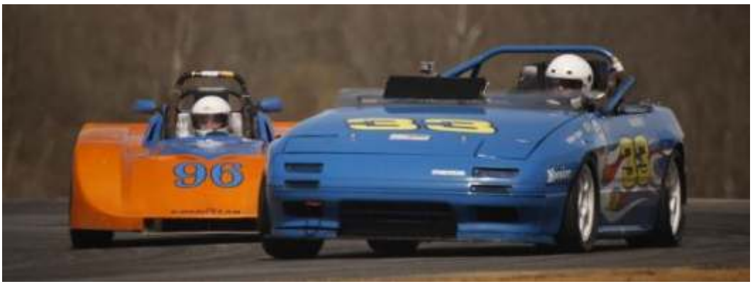
F and S Enterprises