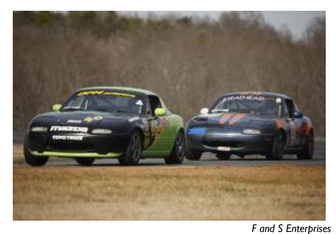
MM: Grp 6 – Spec Miatas

4. Sports Car Weekend. Information as to a Sports Car Weekend communication for the State of North Carolina is being referred to the Central Carolina Region, as this proposed event is located in their territory.