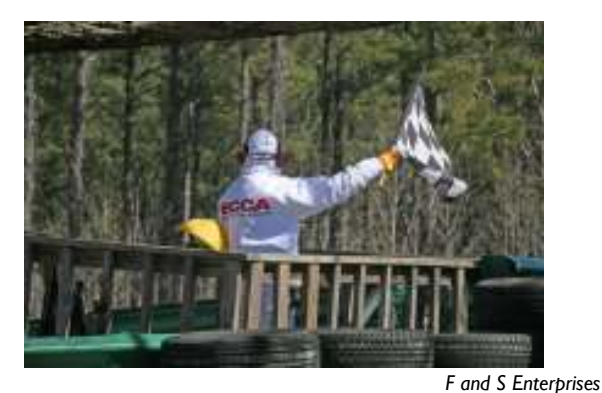
March Memories – Checkered Flag

Motion to adjourn at 10:12 p.m.; Passed.