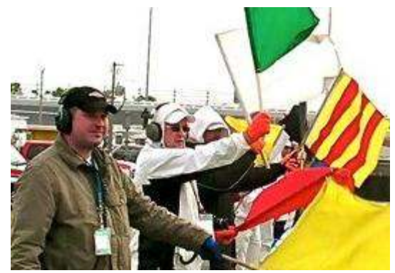
An F-1 Salute