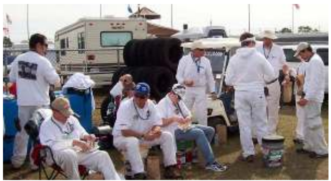
The NCR Crew

On Thursday and Friday, I got to stand on top of the 10 story Daytona tower and spot for the Subaru team running in a 2.5 hour race. Even with my acrophobia, I had to say it was a great view and definitely a good place to watch from.