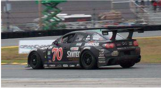
Speedsource RX-8: The GT Winner

Daytona with the greatest workers I know. Now, it's time to support NCR and work all our events coming up this year. Plans are already being made for next year's assault on Daytona for the Rolex 24.