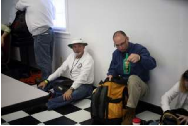
A little classroom instruction: