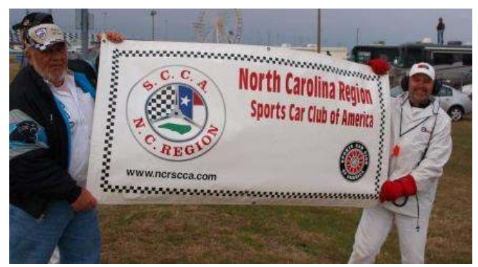
The NCR Banner