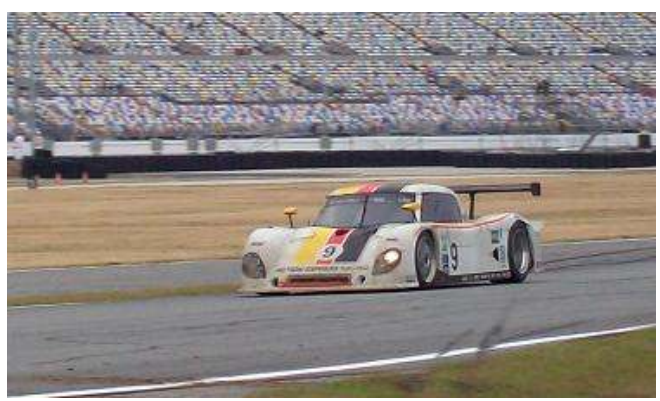
Action Express Racing Porche: The Winner