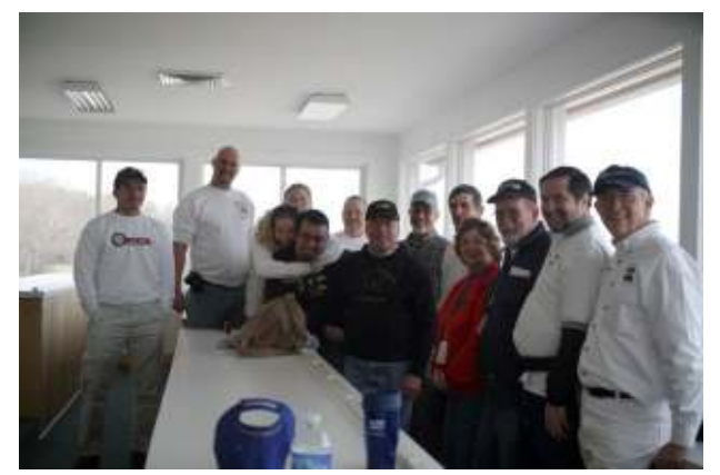
Let's have a great 2010!!!