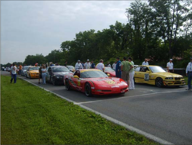
Only 29 cars lined up on the grid for the race. A sign of the times?

to work the 13-hour Charge of the Headlight Brigade in years past during some of the coldest times, it was my first 12-hour race in dealing with the heat, hot sun and humidity. As there were only 29 cars that started the race, the field would be spread out into two running groups of Spec Miatas and BMW's mixed in with two Corvettes. Shockingly enough, there were no Spec Racer Fords entered in the event since the race would only have to deal with 15 minutes of darkness.