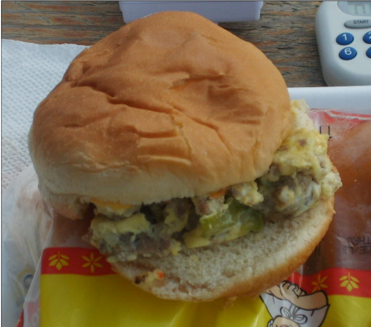
The famous Summit Point "Bud"wich. Yum, Yum!!